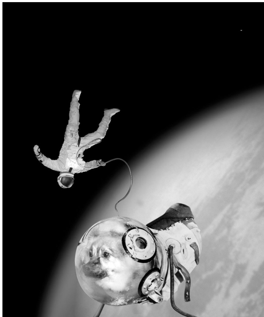
«Sputnik»: Ivan and Kloka performing their historical EVA (Extra Vehicular Activity), 1968