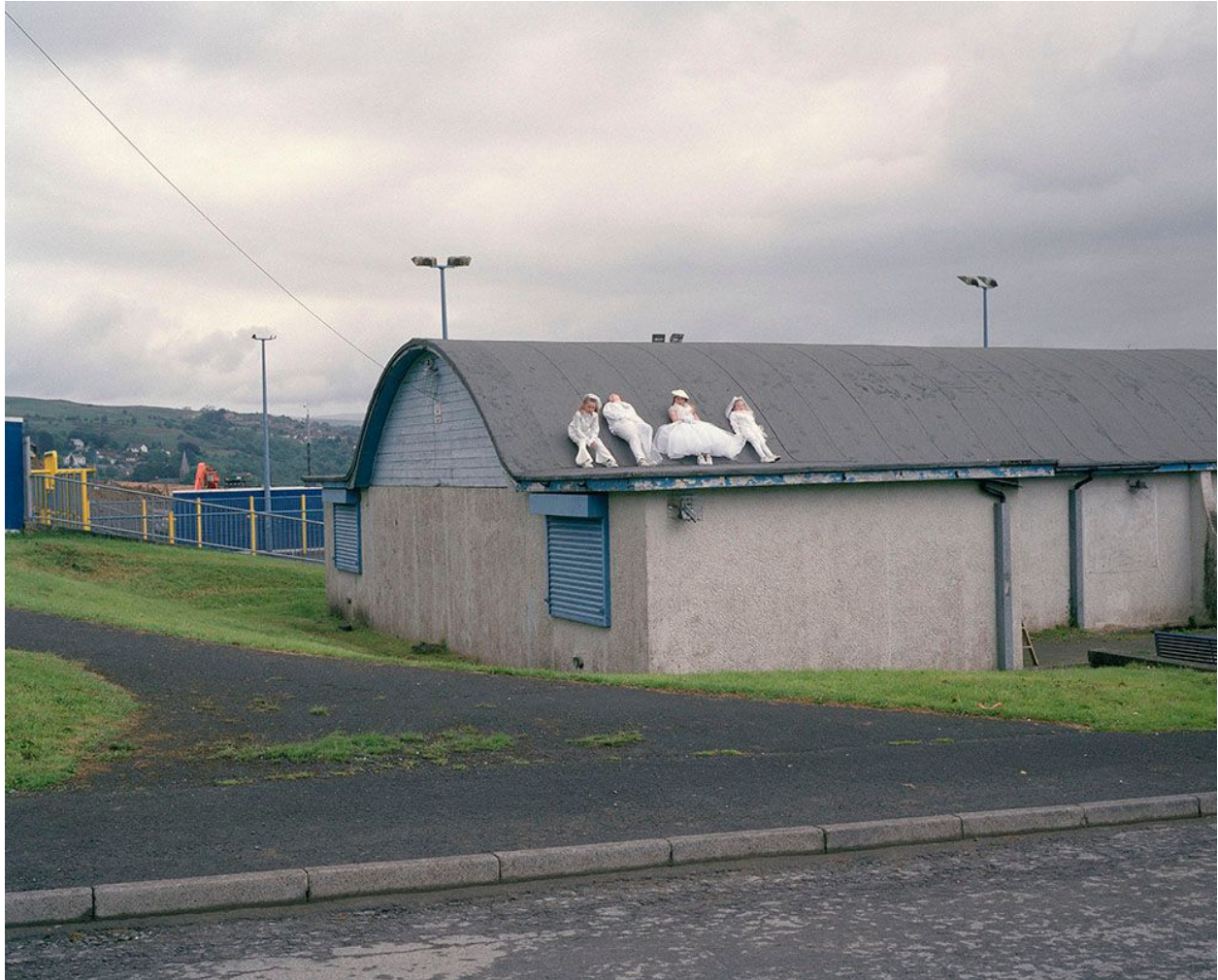
Climbing on The Roof is Not Permitted, Gelligeg, 2017